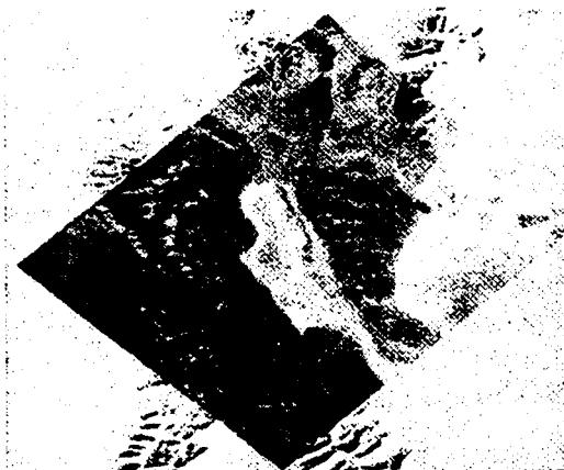
Figure 3. ASTER VNIR composite and DEM

ASTER simulations over test sites at Lake Tahoe, CA; Cuprite, NV; and the Drum Mountains, UT have also been generated. AVIRIS data are being used to simulate the VNIR and SWIR bands, while TMS data are used for the TIR bands. The Cuprite data set will have a DEM derived from aerial photography, while the Drum Mountains data set uses a DEM derived from SPOT stereo data. Some atmospheric corrections may also be performed using prototype ASTER algorithms to obtain radiances at the ground. Further work may involve the use of other prototype algorithms to generate simulated higher level products.