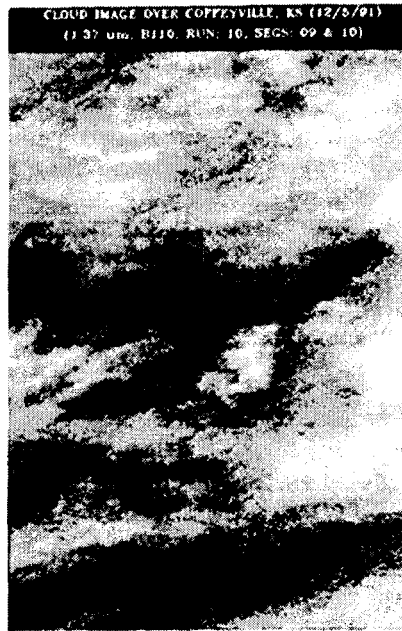
Fig. 2: A 1.37 \mu\text{m} AVIRIS image over the same area as that of Figure 1. Only cirrus clouds are seen in this figure.