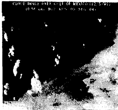
Fig. 3: A 0.56 \mu\text{m} AVIRIS image over the Gulf of Mexico. Both the upper level extensive cirrus clouds and the lower level smaller cumulus clouds are seen.