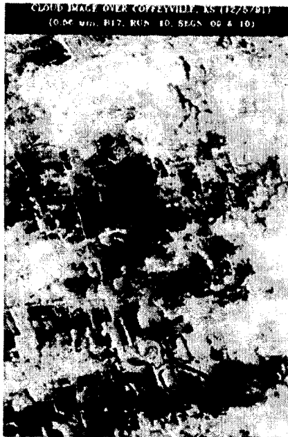
Fig. 1: A 0.56 \mu\text{m} AVIRIS image over Coffeyville, Kansas. Surface features are seen in this figure.