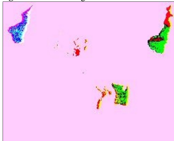
Figure 3 - MNF image to the study area.