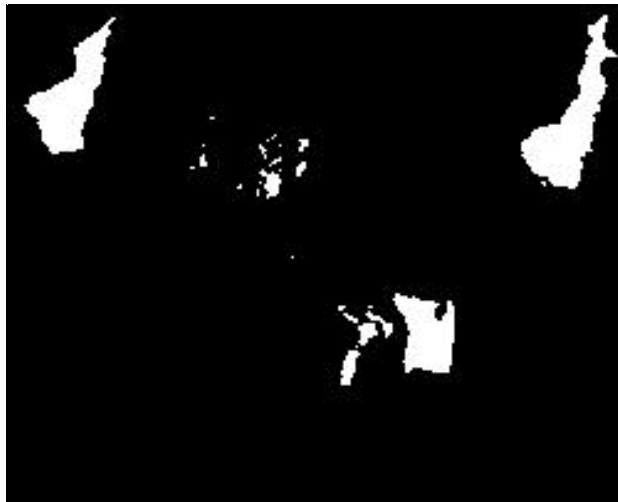
Figure 2 – Mask image built from ISA Method

The methodology presented here is an efficient method for mapping an opaque body.